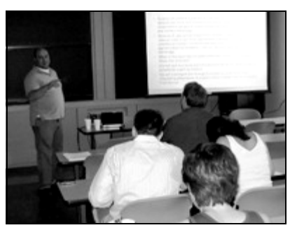
The 2008 seminar, held in building 1.