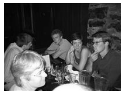
Summer Fellows discuss over dinner.

rates, which means six nights in a single room will cost about $336, and in a double about $234.