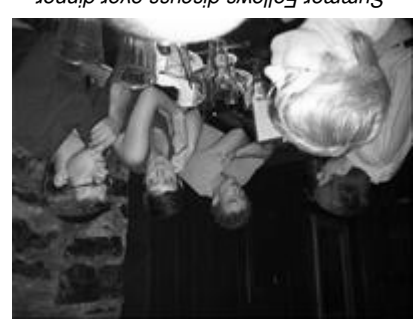
Summer Fellows discuss over dinner.

will cost about $336, and in a double about rates, which means six nights in a single room