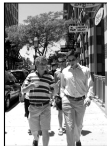
ISN Summer Fellows walking back after lunch.

The fee for the Summer Seminar and Conference is $200. Board will cost $175 and includes lunch and dinner for the week and at least one special group dinner at a nearby restaurant. Room rates are set by MIT and have not yet been posted. They are expected to approximate last year's