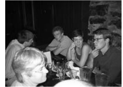
Summer Fellows discuss over dinner.

rates, which means six nights in a single room will cost about $336, and in a double about $234.