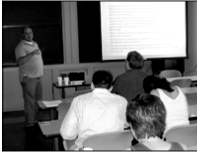
The 2008 seminar, held in building 1.