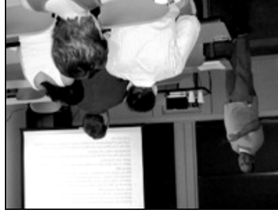
The 2008 seminar, held in building 1.