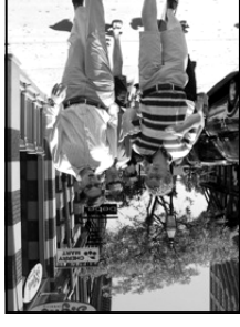
ISN Summer Fellows walking back after lunch.

The fee for the Summer Seminar and Conference is $200. Board will cost $175 and includes lunch and dinner for the week and at least one special group dinner at a nearby restaurant. Room rates are set by MIT and have not yet been posted. They are expected to approximate last year's