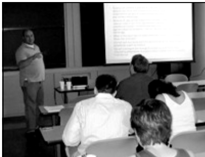
The 2008 seminar, held in building 1.