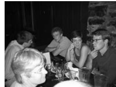
Summer Fellows discuss over dinner.

rates, which means six nights in a single room will cost about $336, and in a double about $234.