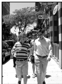
ISN Summer Fellows walking back after lunch.

The fee for the Summer Seminar and Conference is $200. Board will cost $175 and includes lunch and dinner for the week and at least one special group dinner at a nearby restaurant. Room rates are set by MIT and have not yet been posted. They are expected to approximate last year's